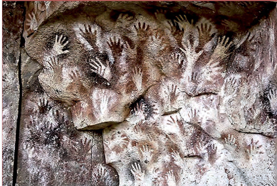
Cueva de las Manos, ~10 000 BCE Rio Pinturas, Patagonia