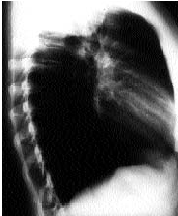
Fig. 1. – Chest radiograph. a) frontal; and b) lateral.