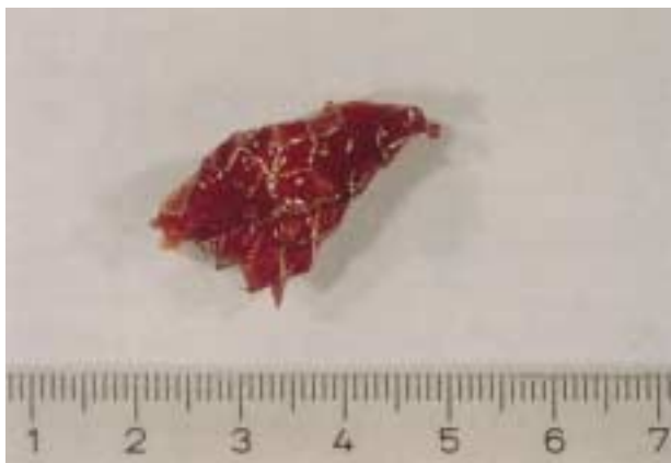
Fig. 2. — Deformed Palmaz-Stent after explantation, blocked by accumulation of purulent secretions.

tional Systems) of axial length 29 mm and diameter 8 mm was inserted at another hospital. Subsequently, the patient experienced substantial clinical improvement for 24 h. Thereafter, mucus retention, dyspnoea and cough recurred and worsened markedly within the following 12 days. Two weeks after stent placement, he eventually presented with acute severe dyspnoea, excruciating and insatiable cough, and expectoration of purulent and viscous sputum. FEV 1 and PEF had once more dropped to a minimum of 1.02 L and 1.38 L·s -1 , respectively. Bronchoscopy revealed obstruction of the tracheobronchial anastomosis by a distorted Palmaz stent with accumulation of purulent secretions, which now functioned as a barrier to mucus transport and airflow (fig. 2). An incorrect placement of the stent had been excluded by means of bronchoscopy and radiography. It was noticeable, that deformation was apparent mainly at the distal part of the prosthesis. After explantation, an 8 mm wide and 40 mm long Strecker-Bronchial-Stent (Boston Scientific Co., Watertown, Massachusetts) was chosen which provided radial compliance and re-expandability. After insertion within the tracheobronchial anastomosis, mucus clearance improved markedly and there was no sign of respiratory distress. FEV 1 improved to 2.03 L. The flow-volume diagram regained a near normal shape, with a PEF of 7.10 L·s -1 (fig. 1c).