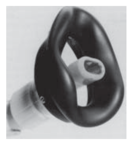
Fig. 1. – Face-mask with a built-in mouthpiece. This combination ensures that the young child breathes through the mouth.

andto prevent nose breathing. This was assured by a mouthpiece within a large mask. In addition, the large face-mask provided effective support to the cheeks (fig. 1).