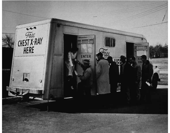
FIGURE 1 Public Health Service mobile chest radiography van with a line of men waiting their turn.

too expensive and logistically challenging to be sustainable. There was also a growing consensus that chest radiography was not sufficiently reliable to be used to establish a diagnosis of TB, given its intra- and inter-reader variability and lack of specificity for TB [5, 6]. Thus, there was a shift in policy away from using radiography to detect TB towards case detection in the primary care setting, based on symptom screening combined with the use of bacteriological investigation of sputum to establish a diagnosis. In 1974 the World Health Organization (WHO) issued a recommendation to abandon “indiscriminate TB case-finding by mobile mass radiography” [7].