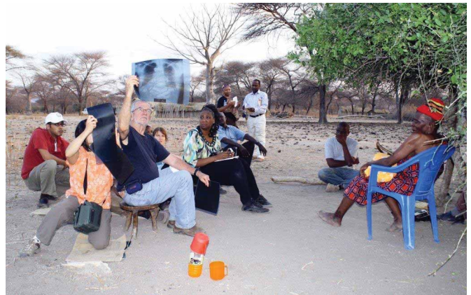
FIGURE 3 Chest radiographs being read in Iringa District, Tanzania.

One such programme for TB detection is highlighted in the paper by RAHMAN et al. [10] that appears in this issue, entitled “An evaluation of automated chest radiography reading software for tuberculosis screening among public- and private-sector patients.” This paper evaluates CAD4TB, a software developed to assign an abnormality score ranging from 0 to 100 to a digital chest radiographic image that reflects the likelihood of tuberculosis based on the shape and texture of abnormalities observed in the image. RAHMAN et al. [10] applied CAD4TB to over 17000 patients from private providers and public clinics referred for TB evaluation in Dhaka, Bangladesh. They show that CAD4TB, using a threshold set to match the sensitivity of the radiologists in the study, could be used to triage symptomatic individuals for testing with