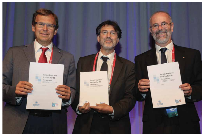
FIGURE 1 Picture of the official launch of the World Health Organization document at the European Respiratory Society International Congress 2016.

In the absence of formal randomised controlled trials, the conventional (or longer) MDR-TB treatment recommended by WHO (based on a minimum of five drugs) is the result of expert opinion based on observational studies [30] and there has been no head-to-head comparison of one MDR regimen versus another MDR regimen of any kind (of note, a trial is currently underway to evaluate a short MDR regimen versus the 20-month WHO standard) [31, 32]. As a consequence, using the GRADE system definitions, the available evidence is generally of “low” or “very low” quality [33]. In addition, the complexity and limited efficacy of current regimens may predispose to development of additional resistance [23, 24]. Finally, it is imperative to lower the cost of MDR-TB regimens to make them accessible in the poorest settings [16, 17].