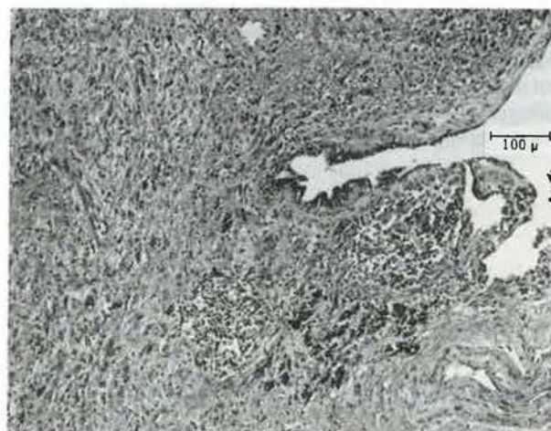
Fig. 3. - Histologic section of the lung showed fibrous nodule with moderate lymphocytic infiltration and capillary endothelial proliferation compatible with nonspecific inflammatory changes.

BAL analysis of our case is presented in Table 1. Total cell recovery was 13.6 \times 10^6 cells. Differential cell count showed 97% macrophages and 3% other cells with 84% T-cells, 2% B-cells. The predominant T-cell subset was T-suppressor/cytotoxic. The T4/T8 ratio was 0.54.