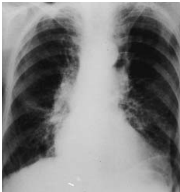
Fig. 2. — Chest radiograph of patient No. 7 with hilar shadows and proximal streaky opacities.

from 36–69% of the predicted value (table 1) and the ratio FEV 1 /FVC ranged 42–72%. Bronchodilators had only minimal effect and did not reveal a background of asthma. Four patients could not produce satisfactory spirometry. In four patients follow-up tests showed progressive accelerated deterioration.