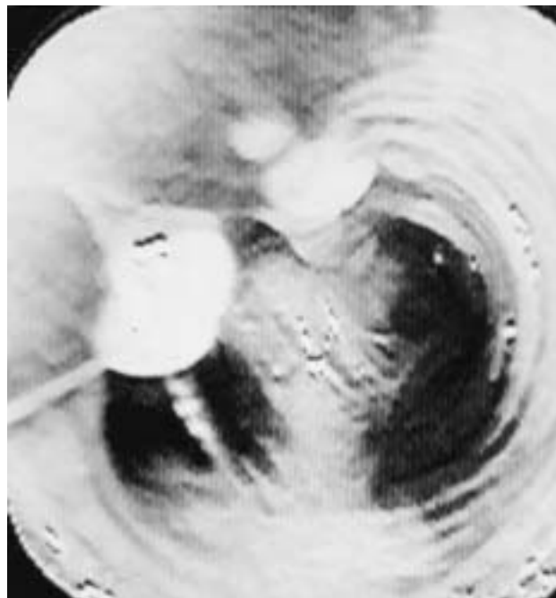
Fig. 3. — Endoscopic view of the main bronchi in patient No. 7. Anthracotic plaques at the bifurcation of trachea with mucus droplets on the surface epithelium.

Biopsies were tried in all patients and revealed epithelial metaplasia containing black deposits and, in some cases, squamous changes. The surface epithelium, how-