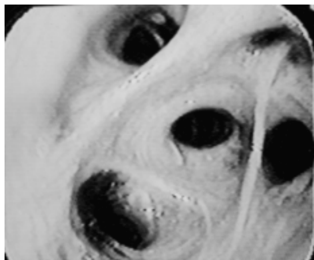
Fig. 4. — Further endoscopic view of the segmental bronchi in patient No. 7 with anthracotic depositions at the entrance of divisions in the right lower lobe.

ever, was often intact (table 2, fig. 5). Subepithelial infiltration of nonspecific inflammatory cells was prominent. Anthracotic pigments were observed in the hyalinized connective tissue stromas. In one case relatively concentrated collections of lymphoid cells with irregular nuclei were recognized. Polymorphonuclear leucocytes were seen only occasionally. No evidence of granuloma formation or malignancy was found. The sample in one case was unremarkable for histology but abundant free black particles were outstanding in the bronchial washings.