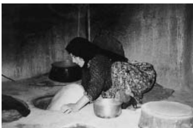
Fig. 1. – A rustic housewife cooking bread for the family is exposed to smoke and fire from a ground oven. Extensive soot-covering of the walls can be seen.

Clinical examination, routine blood chemistry, and haematology were carried out for all the patients. In all cases chest radiographs, and in two cases computed tomography (CT) scans, were available. Pulmonary function tests were limited to forced vital capacity (FVC) and forced expiratory volume in one second (FEV 1 ) using the Farafan computerized spirometer (SP 722; Farafan Co., Tehran, Iran). The figures were compared with the findings of normal values from an Iranian study [13–14], although the latter