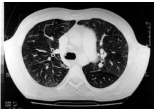
Fig. 1. — a) Computed tomography (CT) scan of the chest, slice thickness 5 mm (at the level of the right main pulmonary artery): revealing mediastinal lymph node enlargement (arrow). b) CT scan of the chest, slice thickness 5 mm (at the level of the azygos vein): showing a mosaic pattern of lung attenuation.

( P_{a,O_2} ) 9.5 kPa (71 mmHg); arterial oxygen saturation ( S_{a,O_2} ) 0.89 at an inspired oxygen concentration of 100%.