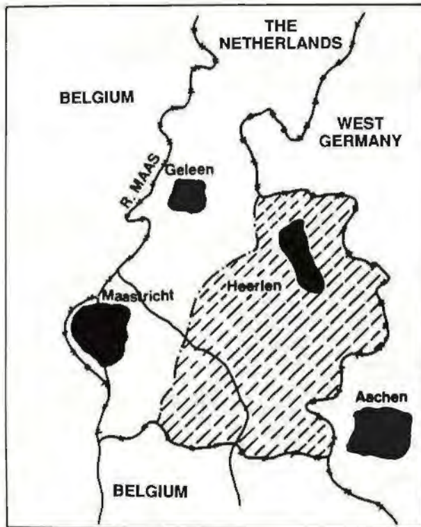
Fig. 1. Map of Southern Netherlands. Old Mining District is shown hatched, with Germany lying to the East and Belgium to the South and the West.

approximately 40% of the specimens examined. Approximately 70% of the total pathogen flora consisted of (in order of importance) H. influenzae , Streptococcus pneumoniae and B. catarrhalis . Haemophilus parainfluenzae , which still amounted to at least 13% of the pathogenic flora in 1980, had practically disappeared from the scene in 1983. H. influenzae , which accounted for 65% of the total isolates in 1977, fell to approximately 35% in 1980 and has remained impressively constant since that time. In contrast, the