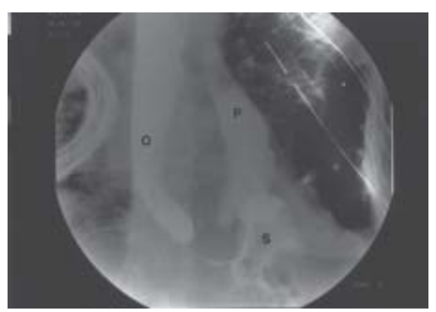
Fig. 2. – Gastrograffin swallow demonstrating contrast in the oesophagus (O), an abnormal stomach (S) and flow of contrast into the left pleural cavity (P).

fistula was suspected, and this was confirmed by cytology of the empyematous fluid, which revealed food debris. A gastrograffin swallow was contemplated but had to be delayed until drainage of the radiodense pleural fluid had occurred. When it was performed, leakage of contrast from the stomach into the left pleural space was demonstrated when the patient was supine (fig. 2). The initial chest radiograph was reviewed, and this, in fact, had shown a small apical left pneumothorax along with the reported left basal pneumonic shadowing.