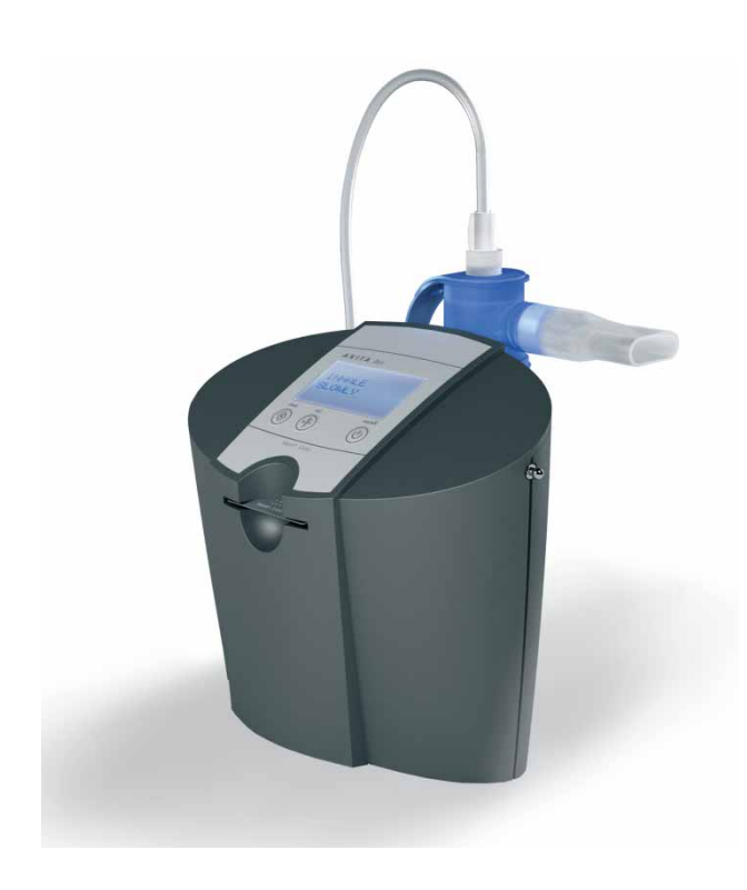
FIGURE 1 AKITA Inhalation System (Activaero GmbH, Gemuenden, Germany).

Patients (≥18 and ≤65 years) in this randomised, parallel, placebo-controlled trial had asthma (≥6 months; allergic or nonallergic; American Thoracic Society (ATS) definition, pre-bronchodilator forced expiratory