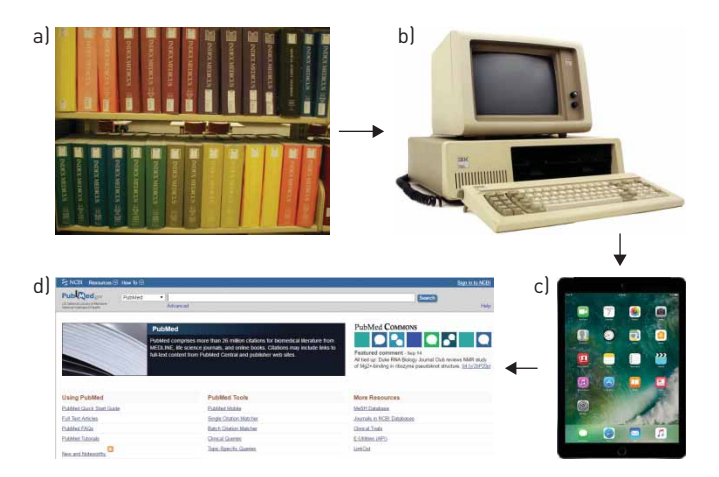
FIGURE 1 Evolution of medical information from a) the Index Medicus to d) PubMed, facilitated by b) the emergence of computers, which in turn allowed c) the development of the internet.

when faced with a clinical problem. In fact, basically all of us have a personal computer in our pocket that is able to make telephone calls besides! This is facilitating tele-health and novel forms of digital research.